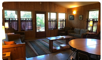
Dederer Center Interior